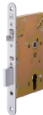
As full leaf version

Fully adaptable. The new standard in locks.